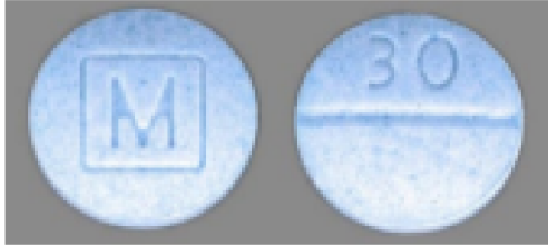
Authentic Oxycodone M30