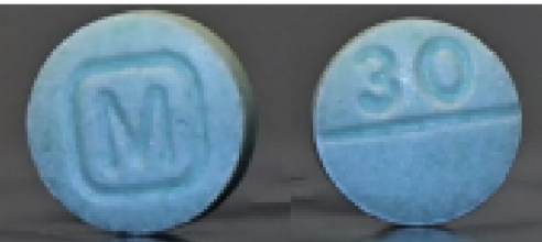
Counterfeit Oxycodone M30