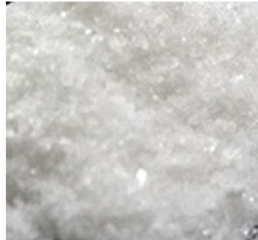
Powdered Crystal Meth

METHAMPHETAMINE IS A HIGHLY ADDICTIVE STIMULANT THAT AFFECTS THE CNS!