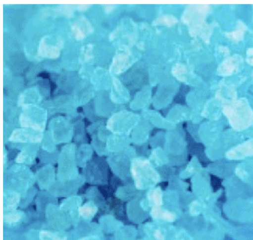
Blue Crystal Meth